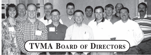
TVMA BOARD OF DIRECTORS

"The Texas Vegetation Management Association supports the vegetation management industry through practical training and technical development while promoting professionalism, industry, education, safety and ethical practices, environmental soundness, academic scholarships, public understanding of our industry, an exchange of information between members and advising and cooperating with legislative and regulatory agencies."